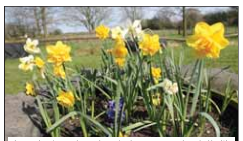
Spot the intruder - hyacinth amongst the daffodils

Following a rather mixed bag of winter weather, spring has finally sprung at Greatwood with early displays of daffodils and hyacinths showing off the best of their eye-catching colour.